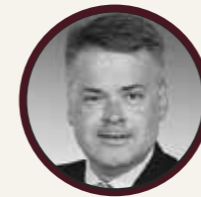
Co-Chair Tim Loughton MP