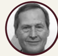
Secretary Lord Alan Howarth