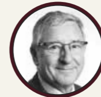
Vice-Chair Jim Fitzpatrick MP